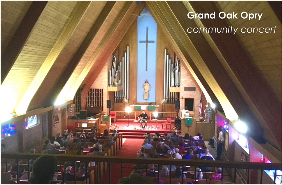
Grand Oak Opry community concert